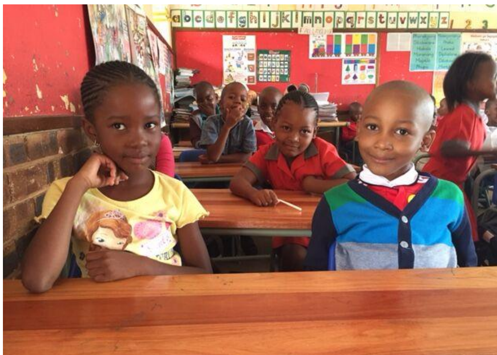
STUDENTS AT BAJABULILE PRIMARY SCHOOL