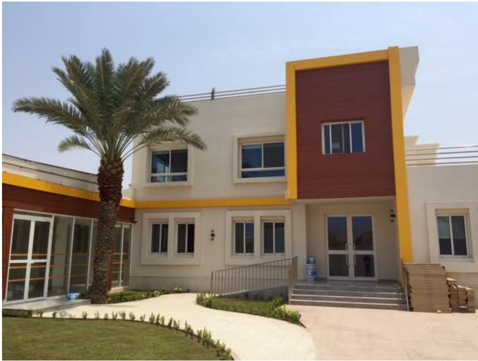
JEDDAH SCHOOL BUILDING